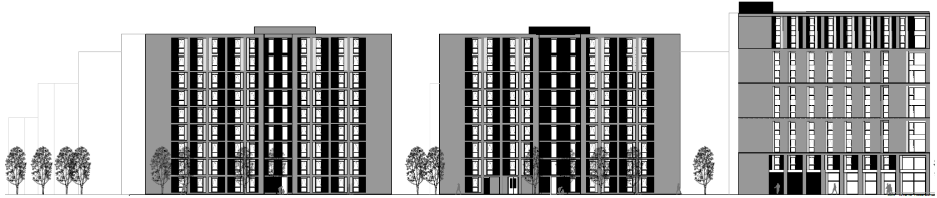
Proposed South East Elevation